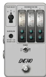
Plate reverb was inspired by EMT 140, which made use of a metal plate suspended in a steel frame, that was able to recreate reverberations similar to those heard in an acoustic space; a renowned studio reverb found on classic recordings.